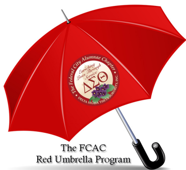
The FCAC Red Umbrella Program

· Legislative Updates - In December, the Social Action Committee began distributing Political & Legislative Updates to sorors at each chapter meeting -- additionally to ensure education and awareness for chapter sorors and to promote increased advocacy. Have you missed one??? It's on our Website!